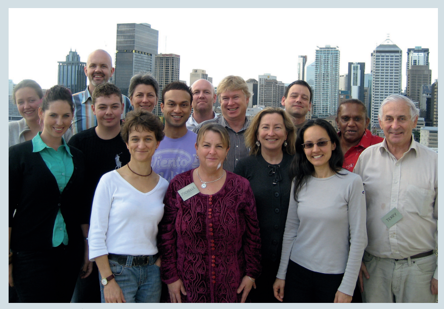
The members of Green Cross Australia's citizen's jury. Green Cross Australia

An April 2008 advertisement placed in The Australian newspaper by Green Cross Australia began a unique, deliberative process inviting the country to consider the role that Australians might play should sea-level rise and climate change result in a significant displacement of people in the Asia Pacific region.